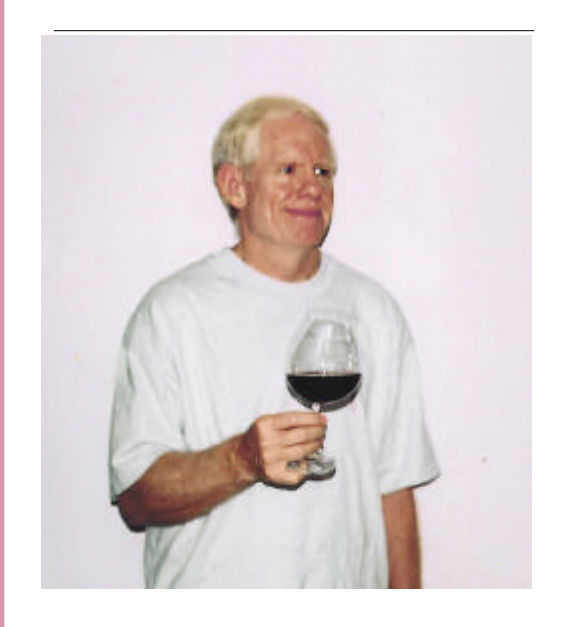
If You Drink No Noir, You Pinot Noir