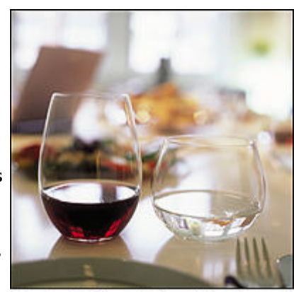
The Syrah/Shiraz (left) and Chardonnay tumblers are two of the 0 collection's six bowl shapes.

The O wine tumbler is made from machine-blown lead-free crystal, which is dishwasher safe. The tumbler comes in six designs specific to wine varieties, including a Pinot Noir style. When tipped over, the tumblers wobble back into an upright position. This feature comes in handy on boats, limousines, airplanes, poolside, and at picnics. The tumblers will not replace stemmed glassware for serious drinkers. They like to hold and swirl via the stem to minimize greasy fingerprints and prevent the wine from warming above its target temperature.