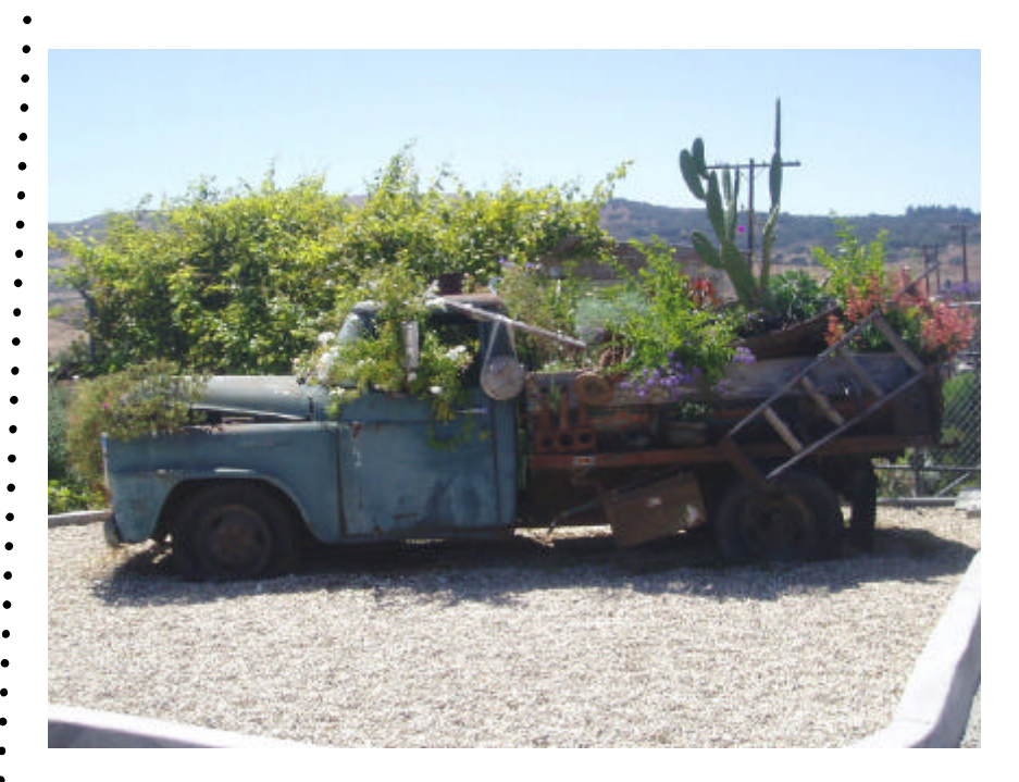
This winery pickup lives on in Orcutt

© 2006 PinotFile is a Registered Trademark