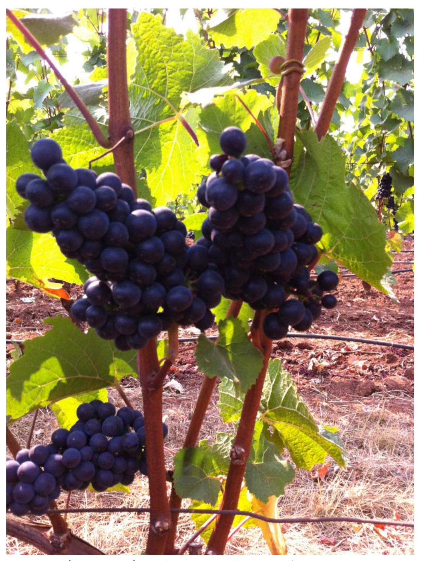
ASW2 at Archery Summit Estate, Dundee Hills