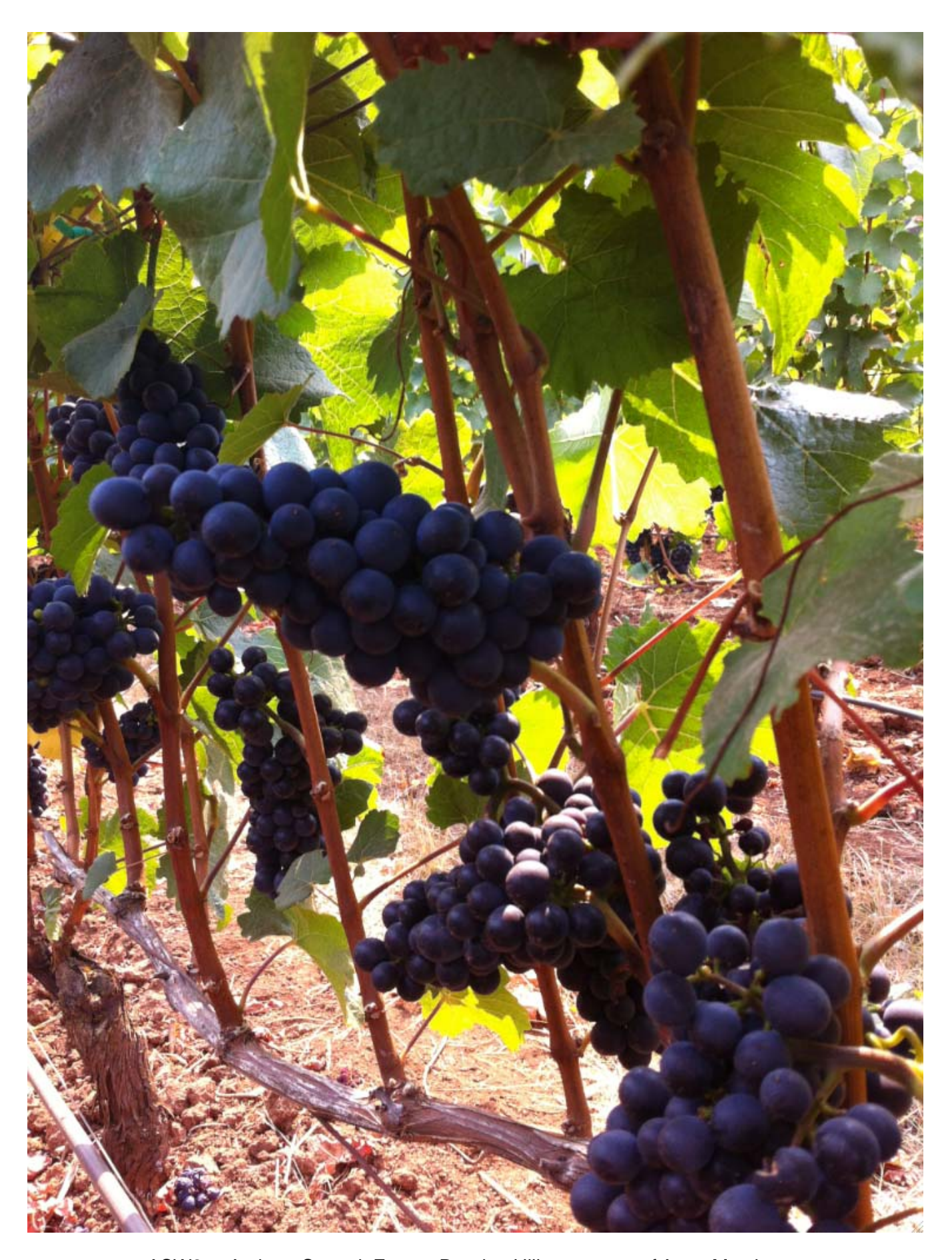
ASW2 at Archery Summit Estate, Dundee Hills