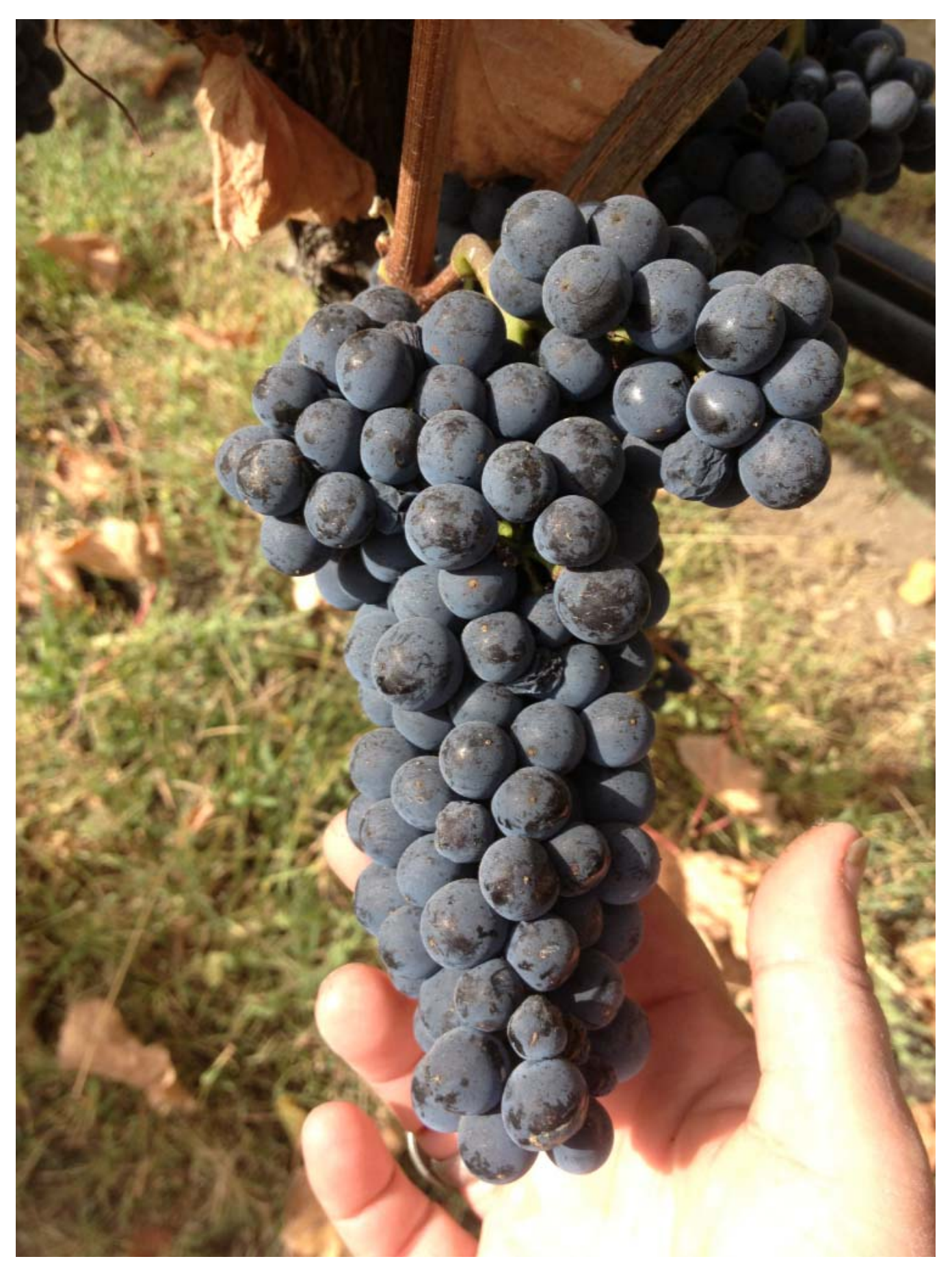
Faux "828," typical giant cluster, 3 days before harvest, Inman Family Winery, Olivet Grange Vineyard, Russian River Valley