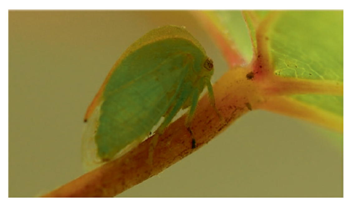
Fig. 14.4 Adult Spissistilus festinus, a confirmed vector of GRBaV, resting on a petiole of a V. vinifera cv. Cabernet Sauvignon leaf

: A possible vector was discovered by researchers at UC Davis headed by Brian Bahder and confirmed by field and greenhouse studies by Marc Fuchs et al. The three-cornered alfalfa treehopper, Spissistilus festinus , was found to be a vector under greenhouse conditions, that is, the vector spread GRBaV virus from infected to healthy vines. It was soon found by researchers that overwintering adults in vineyards that were infected with the virus in the salivary glands indicated that they would be capable of spreading the virus (but more research needed to be done). The three-cornered alfalfa treehopper prefers alfalfa, soybean and bean, all leguminous plants. The finding did not rule out the possibility of other vector species such as other treehopper species, leafhoppers, planthoppers and plant lice, and more confirmation was needed in the field. University of California at Berkeley entomologist, Dr. Kent Daane, reported that he did not believe there was any conclusive evidence of a vector and and he recommended that suspicious vectors should not be treated with insecticides because of red blotch.