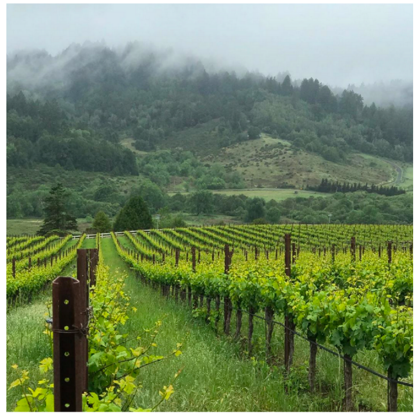
Royal St. Robert Vineyard

2018 RAEN Sonoma Coast Royal St. Robert Pinot Noir 12.5% alc., $70. A special bottling dedicated to Robert Mondavi. A selection of the finest barrels. Moderately dark garnet color in the glass. The nose is more expressive over time in the glass. revealing aromas of dark cherry, burnt tobacco and dried herbs. Soft in the mouth and relatively light in weight, offering fruit flavors of black cherry and black raspberry with an underpinning of dried herbs and smoky oak. Very fine-grain tannins make for easy approachability, but the wine picks up more fruit intensity and finishing length over time. 91.