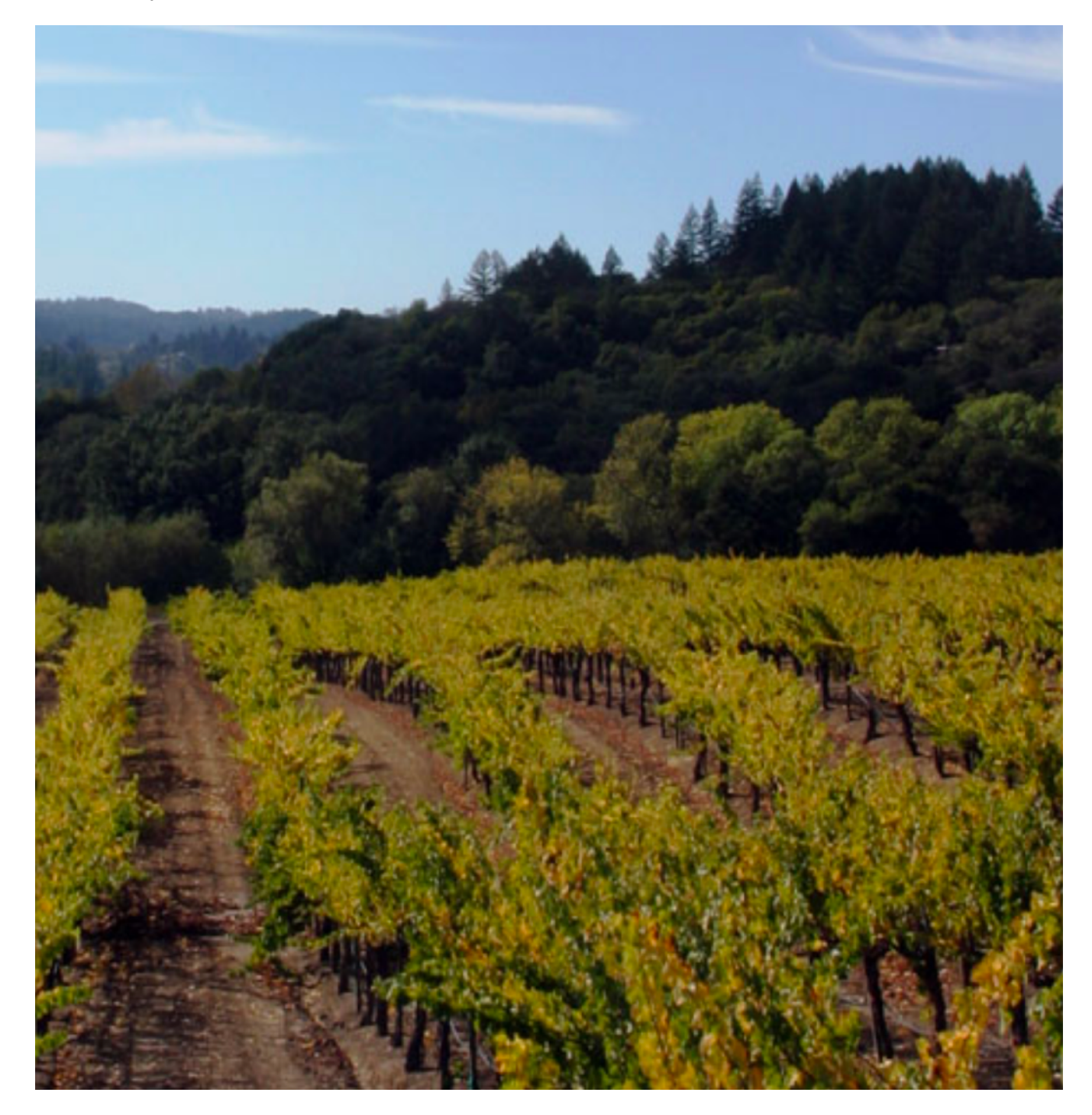
2014 Woodenhead Ritchie Vineyard Cinder Cone Russian River Valley Pinot Noir 13.0% alc., $65. Dark garnet color in the glass. A Pinot Noir nose to die for, with the glorious perfume of black cherry, spice and rose petal. Nothing is out of place in this mid-weight plus styled beauty offering layers of gregarious dark cherry and purple berry fruit flavors that caress the palate with silkiness. Impeccable harmony and a lengthy finish that provides a juicy, citric edge. This wine simply tastes damn good. Reviewed August 27, 2020. 95

Comments: The Ritchie Vineyard is renowned for Chardonnay and I consider it one of the top four Chardonnay vineyards in the North Coast. The 1972 plantings of Old Wente Chardonnay are most prized by winemakers.