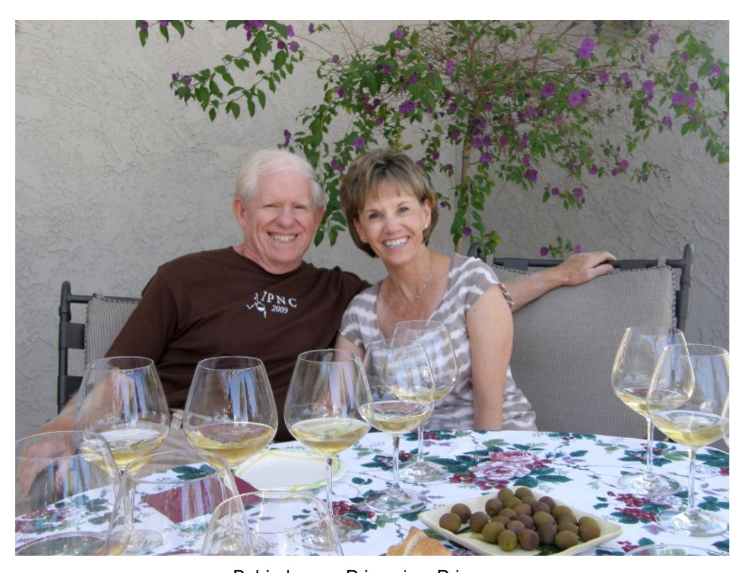
Behind every Prince is a Princess

Picking a Pinot Noir is like starting a romance - the success rate is not high.